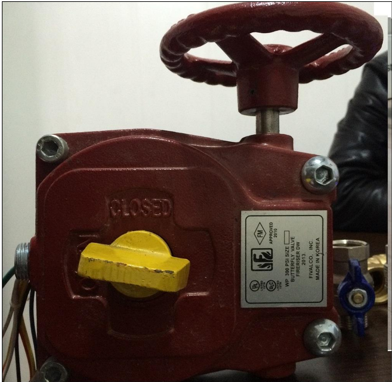
Figure 1. Counterfeit valve

Figure 1 below shows a photograph of the top of the counterfeit valve. The nameplate indicates it is a model DW produced in 2013 with a maximum rated working pressure of 300 psi. Production of the Fivalco IBV ceased on the model DW before 2013 and when it was produced, its maximum rated working pressure was 175 psi. The fitting, provided for connection to electric conduit for the monitoring wires, appears also to be steel. The authentic DW used a brass fitting, similar to the one seen on the authentic model DG in Figure 2 on the following page.